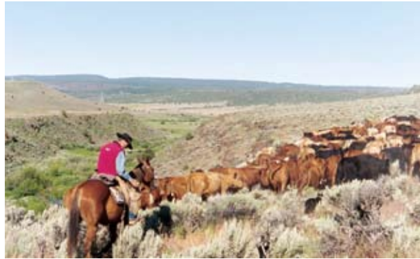
A Country Natural Beef rancher moving some heifers.

Key points in the final recommendation that was adopted by the cooperative’s members included: a) creation of a membership-based management team whose members would serve as contact persons for sets of nine to ten ranchers,