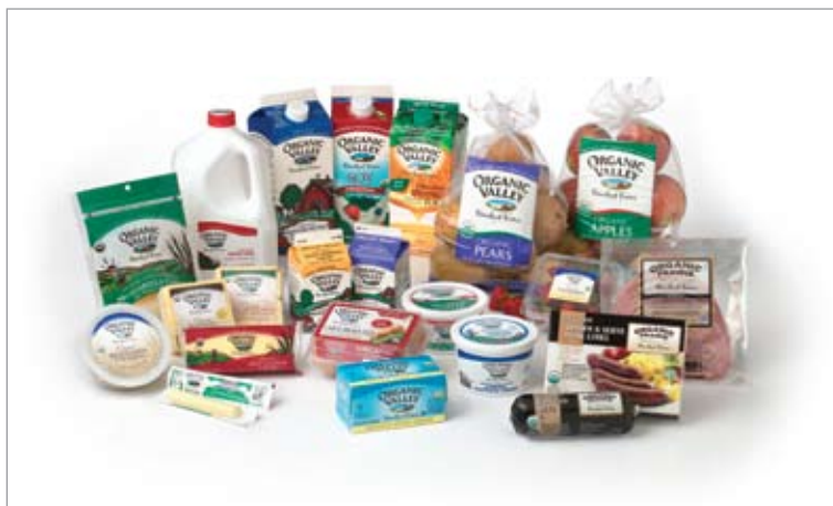
An array of Organic Valley products

In addition to the USDA Organic Certification, many Organic Valley products carry Orthodox Union Kosher Certification < www.organicvalley.coop/fileadmin/pdf/kosher.pdf >. See “Standards and certification,” page 5, for more information.