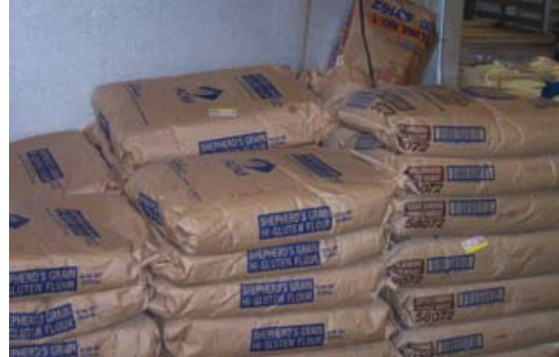
The same price is charged to both small and large buyers of Shepherd's Grain flour at the ADM mill.

their conventionally farming neighbors for leased land (newsletters #32-#35).