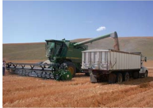
Harvesting wheat on a Shepherd’s Grain farm.